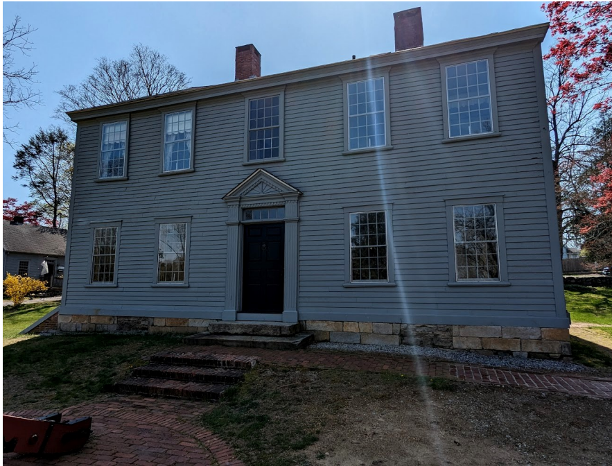
(Nathanael Greene's homestead)